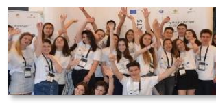
Priority axis 4

A skilled and inclusive region - 34 projects (counting also the two terminated projects)