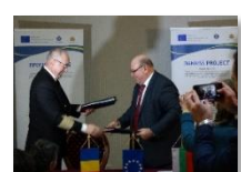
Priority axis 5

A skilled and inclusive region - 34 projects (counting also the two terminated projects)