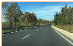
Priority axis 1