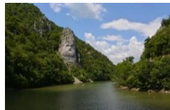
Priority axis 2

A green region - 70 projects (counting also the terminated project)