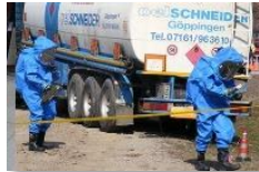
Priority axis 3

A green region - 70 projects (counting also the terminated project)